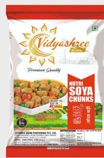
SOYA CHUNKS BAGS