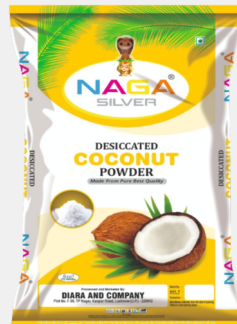
COCONUT POWDER BAGS