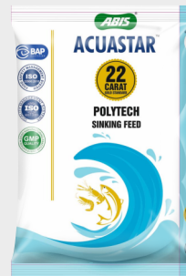
ANIMALS FEED BAGS