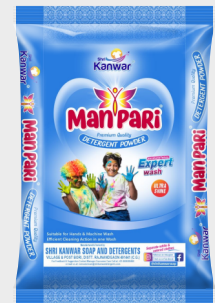
DETERGENT POWDER BAGS