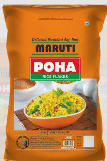
RICE FLAKES BAGS