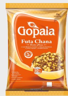
FUTA CHANA BAGS