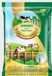
CATTLE FEED BAGS